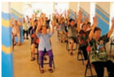
Asian Women's Welfare Association: morning exercise session.

The role of the ABS is to represent and further the interest of its member banks, set standards of good practice and upgrade the expertise of the Singapore banking sector. The association holds regular consultations with the MAS to discuss industry issues and promote a sound financial system. It also provides input for legislation and guidelines relating to the financial industry, and helps establish common ground for member