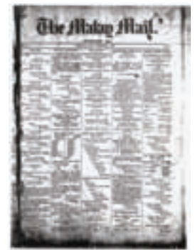
The Malay Mail