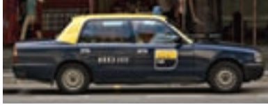
Taxis: some company liveries (clockwise from lower left) Yellow-Top Cabs; Premier Taxis; ComfortDelGro; CityCab; TransCab Services; Smart; SMRT Taxis.

taking passengers to popular destinations for fixed fares. In 1970, there were an estimated 8,000 pirate taxi operators. However, most of these left the business during the 1970s with the formation of COMFORT (a transport co-operative established by the NATIONAL TRADES UNION CONGRESS), increases in diesel taxes, and more stringent regulation of the industry. In the late 1960s, non-transferable taxi licences were issued to individuals. However, new licences have been issued only to taxi companies since the 1970s.